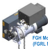
FGH Motor Operator with AR-C (FGRL Motor Operator Similar)